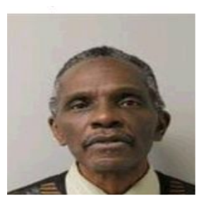
Charge/Offense Prior code: rape by force.

Location Details 1913 D St, Sacramento, CA 95811-1122