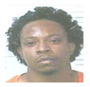
Charge/Offense Sodomy by use of force or injury.