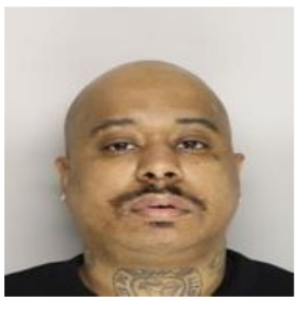
Charge/Offense Lewd or lascivious acts with a child 14 or 15 years of age and offender 10 or more years older than victim.