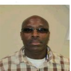
Charge/Offense Rape by force or fear.