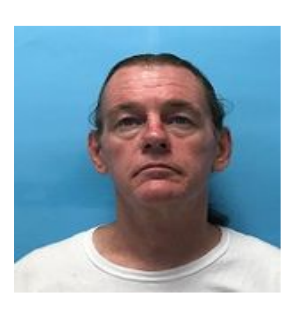
Charge/Offense 03/16/1996 sexual battery.