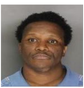
Charge/Offense Rape by force or fear.