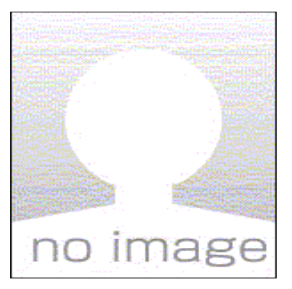
Troy Lee Vickers, 55

Possess/control obscene matter depicting minor in sexual conduct.