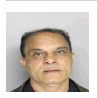
Charge/Offense Sexual battery.