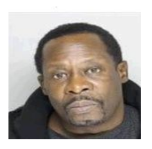
Charge/Offense Prior code: rape by force.

Lewd or lascivious acts with a child under 14 years of age.