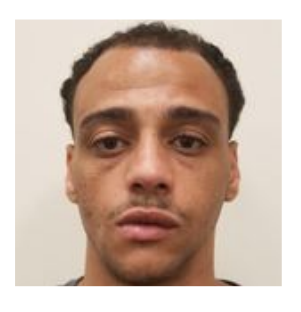
Offense Code LA6717879

Lewd or lascivious acts with a child under 14 years of age.