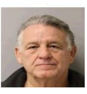
Charge/Offense Prior code: rape by force.